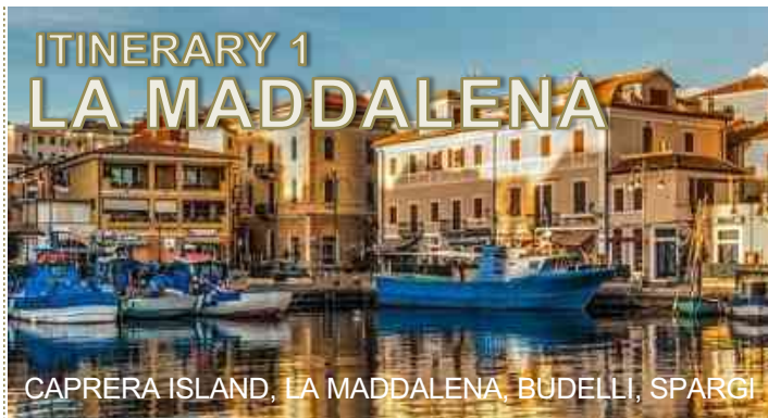
CAPRERA ISLAND, LA MADDALENA, BUDELLI, SPARGI