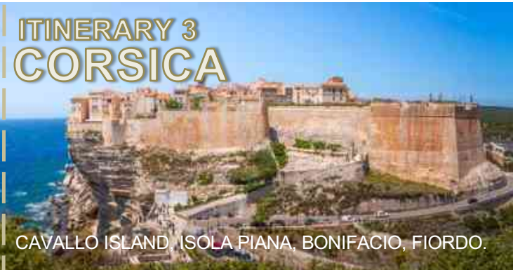
CAVALLO ISLAND, ISOLA PIANA, BONIFACIO, FIORDO.