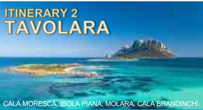
CALA MORESCA, ISOLA PIANA, MOLARA, CALA BRANDINCHI.